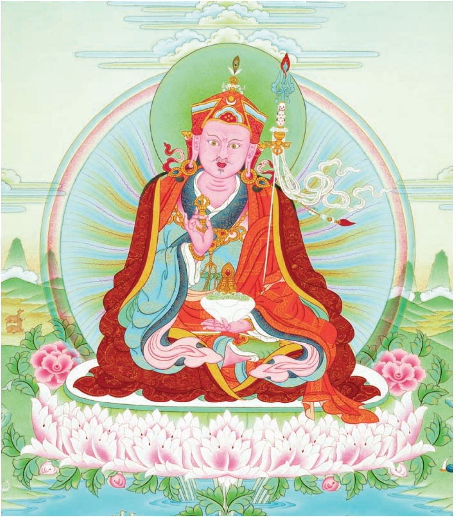
PLATE I GURU PADMASAMBHAVA