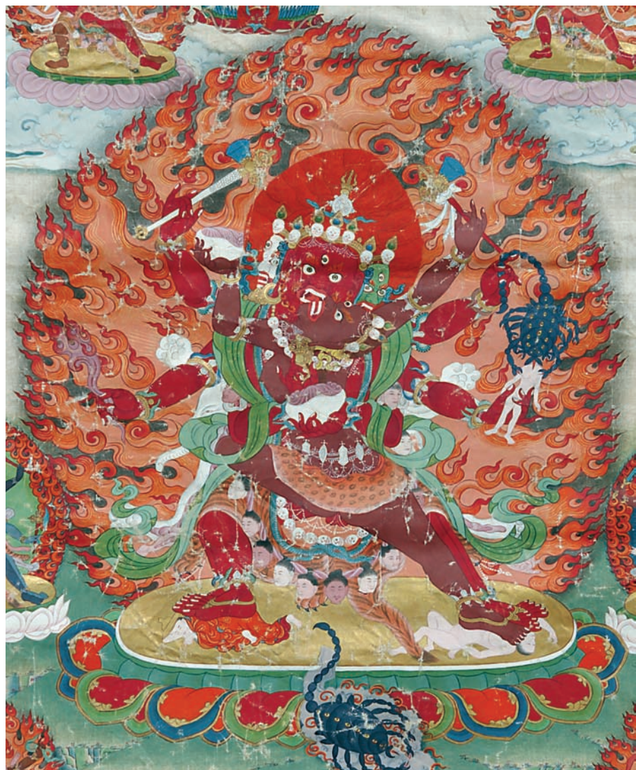
PLATE 3 MAHOTTARA HERUKA AND KRODESHVARI WRATHFUL MANIFESTATION OF THE PRIMORDIAL BUDDHA