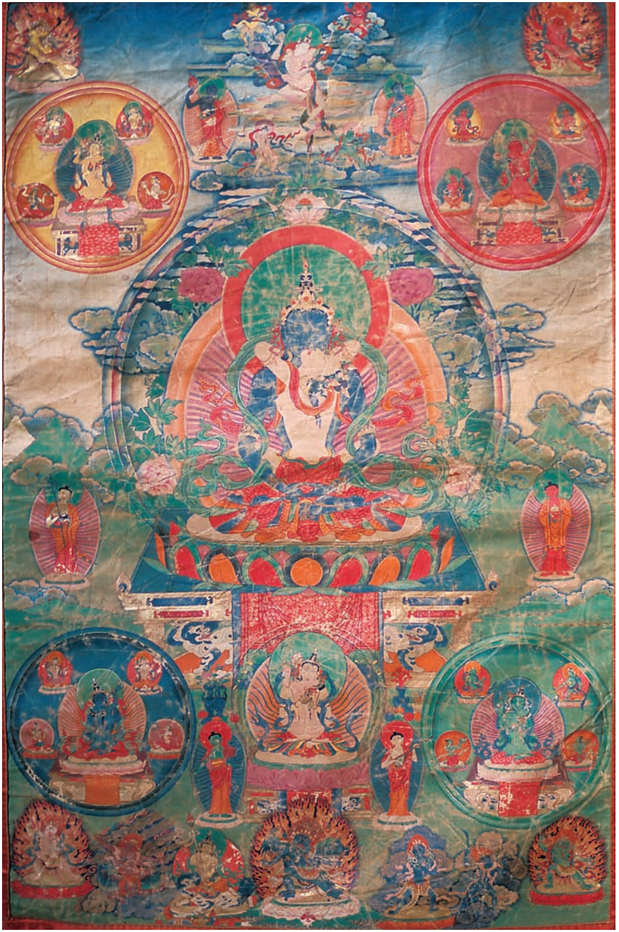
PLATE 4 SHITRO THANGKA PEACEFUL AND WRATHFUL DEITIES