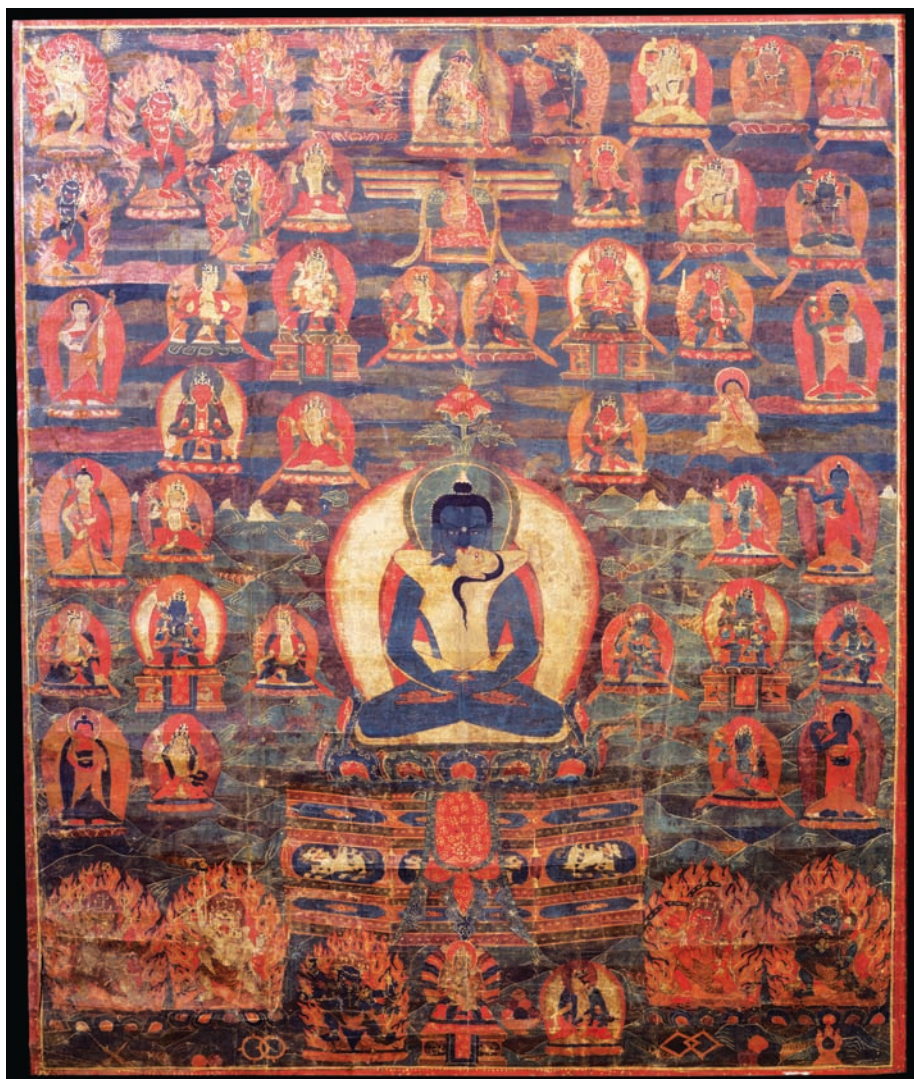
PLATE 2 SAMANTABHADRA AND SAMANTABHADRI PEACEFUL MANIFESTATION OF THE PRIMORDIAL BUDDHA