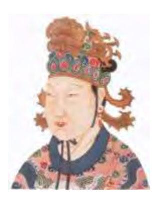
5.2.2.1 Wǔ Zétiān By a court painter

5.2.2.1 RISE TO GREATNESS. The story of Wǔ Zétiān , the only woman to rule China as an empress, was contemporaneous with that of the sixth patriarch. We will study the Wǔ Zétiān story first as a backdrop to Huìnéng, and also because her story is significant in terms of a strategic study of Buddhist history, and is, in many ways, more complicated than the Huìnéng story [5.2.4.1].