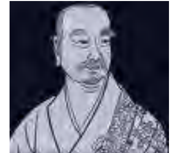
5.2.1.2 Yùquán Shénxiù (605-706) (From stele engraving)

According to doctrine of Buddha-nature [4.1, 4.2] that was current in China from the 4th century onwards, all sentient beings have the capacity to become Buddhas . Teachings of —sudden enlightenment," which became standard doctrine within Chán after the controversy, held that all beings are inherently endowed with Buddhahood. As such, enlightenment takes literally no time at all, since practice and en-