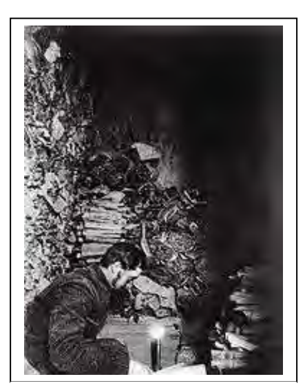
5.2.5.1c Paul Pelliot in Cave 16, Dunhuang, 1908

The Mògāo Caves are the best known of the Chinese Buddhist grottoes, which along with Longmen Grottoes and Yungang Grottoes, are the three most famous ancient sculptural sites of China. The caves contain some of the finest examples of Buddhist art spanning a period of 1,000 years and covering 45,000 square meters of frescos, 2,415 painted statues and five wooden-structured