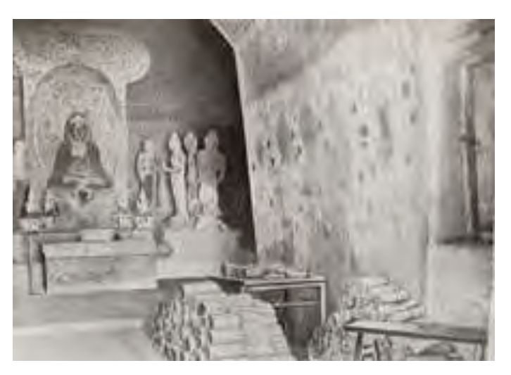
5.2.5.1b A cave shrine, Mògāo Caves, Dunhuang (British Museum)

In 1908, Paul Pelliot , a French Sinologist and explorer of Central Asia, discovered a huge cache of ancient texts in Cave 16 of the Mògāo Caves in Dūnhuáng. These manuscripts were hand-written in many languages, including Chinese, Tibetan and Uighur, and had been hidden away safely during a period of civil unrest, and then left undisturbed for centuries after. The manuscripts were removed by Paul Pelliot and Aurel Stein, and divided between them the British Library in London and the Bibliothèque nationale in Paris, with smaller holdings in Beijing, Petrograd (St Petersburg, USSR) and Copenhagen. <sup>222</sup>