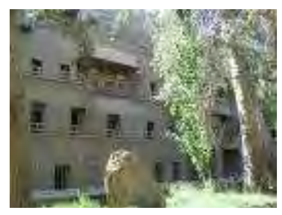
5.2.5.1a Mògāo Caves, Dunhuang www2.kenyon.edu/.../Fac/Adler/Asia490/syl490.ht

caves. <sup>220</sup> Construction of the Buddhist cave shrines began in 366 CE as repositories of scriptures and art. <sup>221</sup> Besides priceless paintings, sculptures, the Mògāo caves housed some 50,000 Buddhist scriptures, historical documents, textiles, and other relics that stunned the world in the early 1900s.