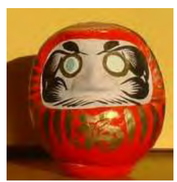
5.1.1b Daruma doll of the Okiagari-koboshi type

<u>5.1.1 Who was Bodhi,dharma?</u> Bodhidharma (Pútídámó 菩提達磨, or simply Dámó 達磨, early 5th century CE),<sup>2</sup> the earliest and a major legendary figure in Chán, traditionally said to have brought it to China. We know very little about Bodhidharma, and we have no contemporary information on him. Later accounts were layered with legend, but most accounts agree that he was either a South Indian or Persian monk who travelled to southern China and subsequently moved northwards.