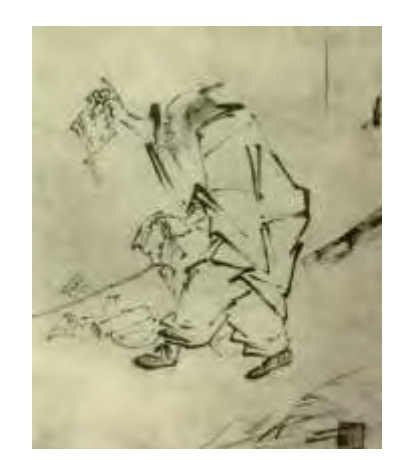
5.2.4.1 Huìnéng "tearing up sutras," by Liáng Kǎi (梁楷) (fl late 12th-early-13th cent).

The message of the (Ahita) Thera Sutta (A 5.88) is simple and clear: even if a teacher is senior, is famous, receives much public donations, is deeply experienced in the Dharma, and is very learned, he still may have wrong view. The wrong views of such a teacher easily and deeply affect the public (including the gods) to their great detriment. Then there are those who, merely on account of five qualities, attribute